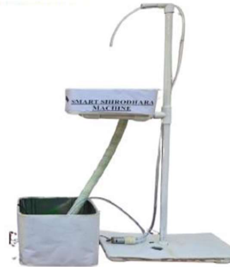
Figure 1: Hardware Model