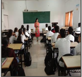
SE -Expert Lecture Soft Skill 28/02/2019.