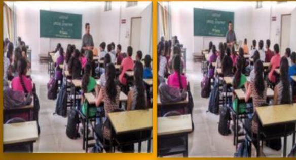
Life Skill Workshop (16/03/2017)

“To develop competent IT professionals for e-development of emerging societal needs.”