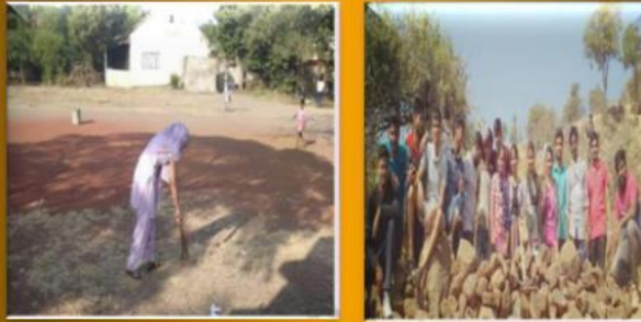
NSS unit of JSCOE (10th January 2017)