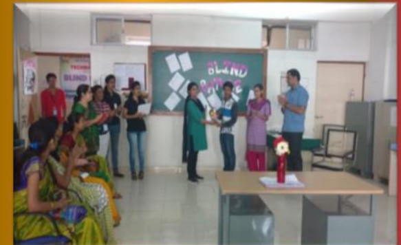
Techmonthan (14-15 Feb 2017)