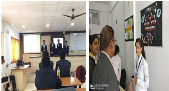
Paper and poster presentation 2018