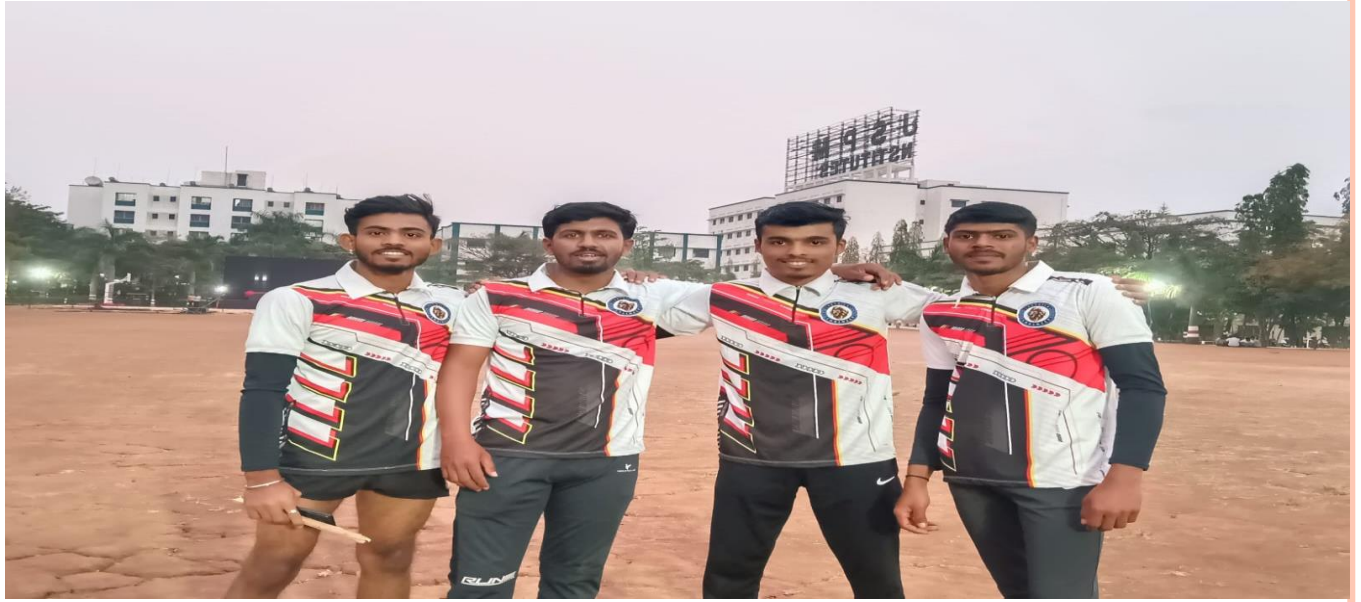
Relay 4x100 Meter Winner .