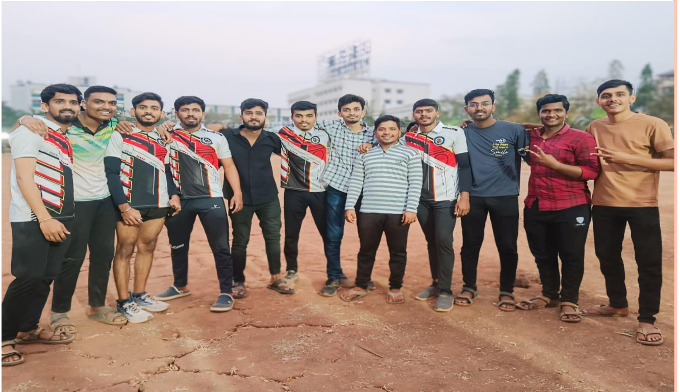
Kho-kho Runner Up